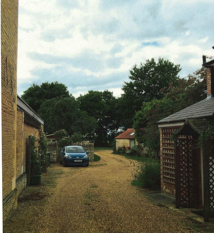
Photo 1 from the footpath on Peterborough Road at the vehicular entrance to 43/45 Peterborough Road, showing trees or parts of trees - T.1, G.1, T.5, T.6, T.10 & T.11;